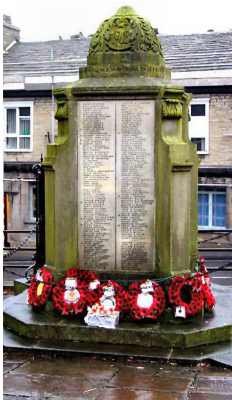
The war memorial at Chapel en le Frith

This work is dedicated to all of the families and individuals whose lives were inexorably changed by the events at home and abroad during the Great War 1914-1918.