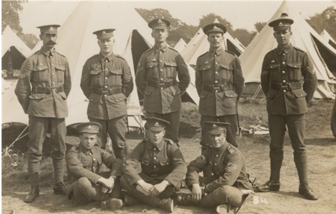
NCO's of 6/SF at Harpenden before embarkation to France.

With most of the able bodied men joining the services, farmers were finding difficulty in obtaining sufficient labour. They were turning to old age pensioners and boys but in due course, this shortage of labour in the fields and the factories, would herald new opportunities for women to break the pre-war shackles and start to go out and earn a wage.