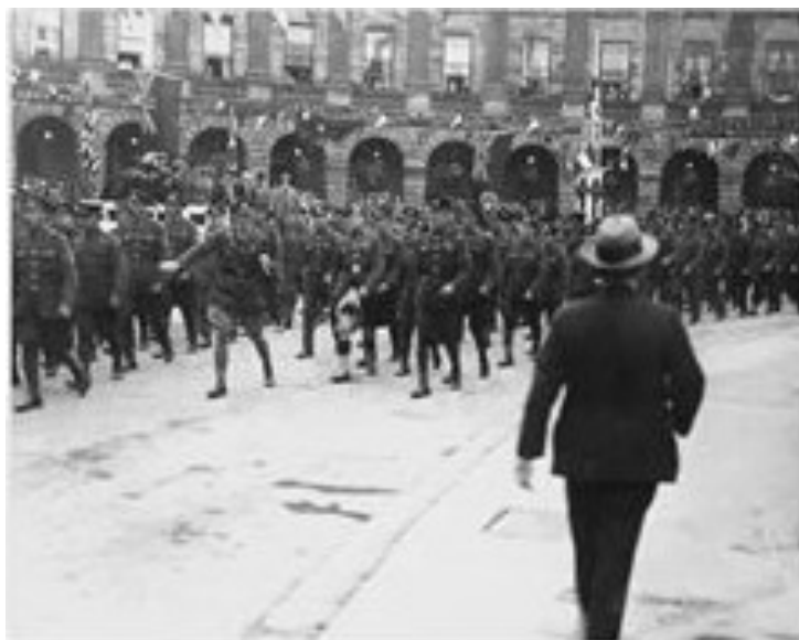
Peace Day 1919 The Crescent, Buxton.

Despite the end of hostilities, the daily grind and shortage of food was to continue. A BHG editorial stated; 'Now that the Armistice is signed and we may hope that the last shot of Armageddon has been fired, many people may be under the impression that all we have to do is to "resume normal conditions". Normal conditions will not resume for many a day to come.' Someone had to shoulder the blame for this state of affairs and of course it has to be the losers. The Prime Minister stated; 'After Victory comes the judgement; the terms of peace must include punishment for the vile crimes and criminals which the war has found in the German ranks.' The Treaty of Versailles not only carved up the world at the behest of the Victors but inflicted terrible financial reparations on the beaten Germans and their ailing economy. 40